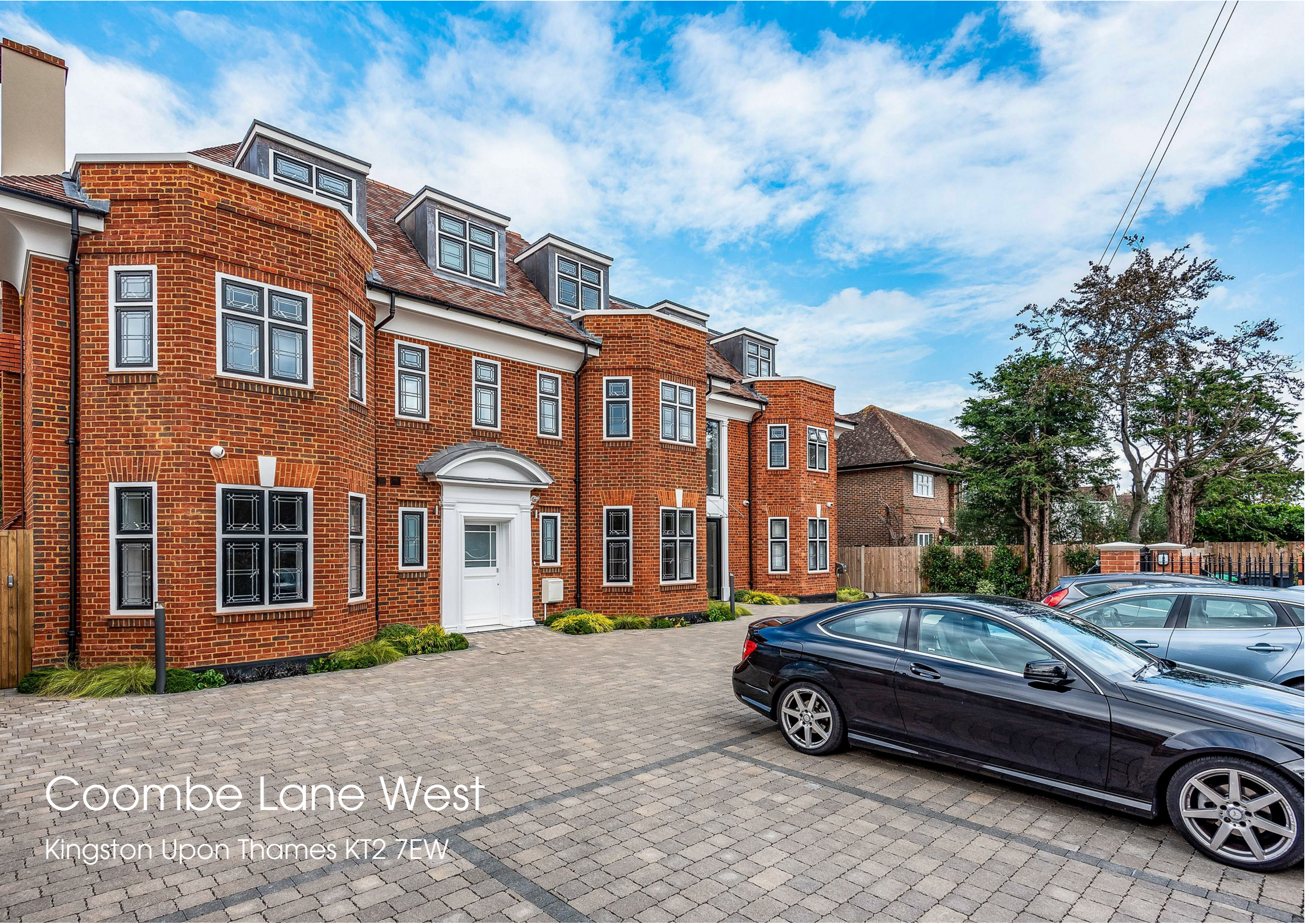
Coombe Lane West Kingston Upon Thames KT2 7EW